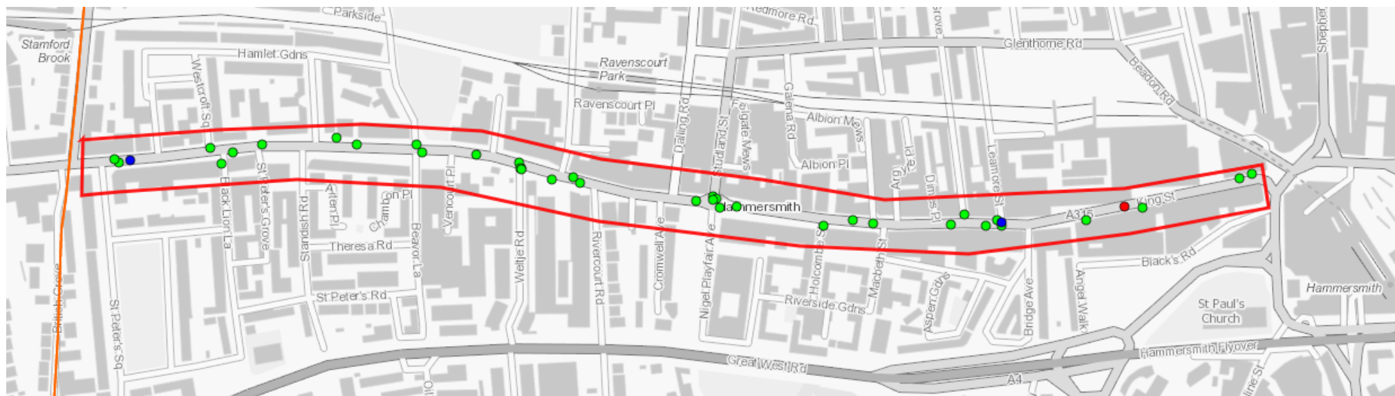
Image 1 – King Street collision data 1 January 2019 – 31 December 2021